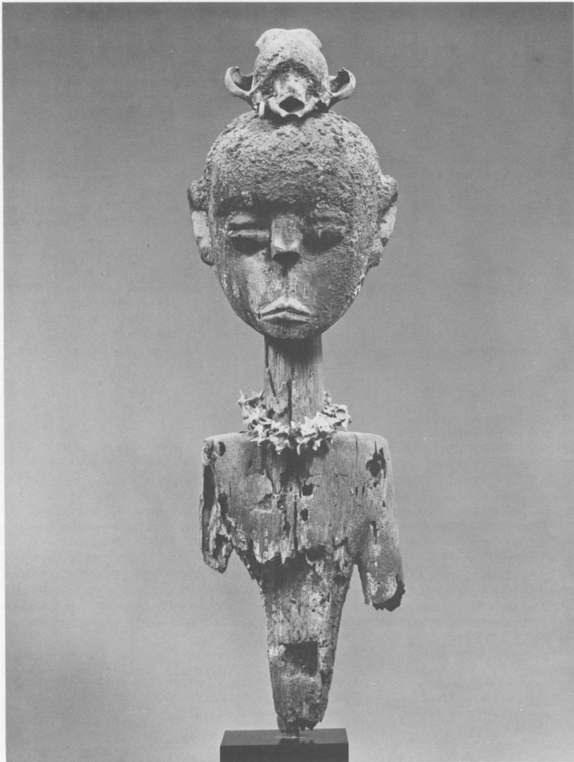
Figure 10. Dahomey bocio figure. Wood, bone, sacrificial materials. h 19½ in. Metropolitan Museum of Art, 1984.190. Purchase, the Denise and Andrew Saul Philanthropic Fund Gift, 1984.