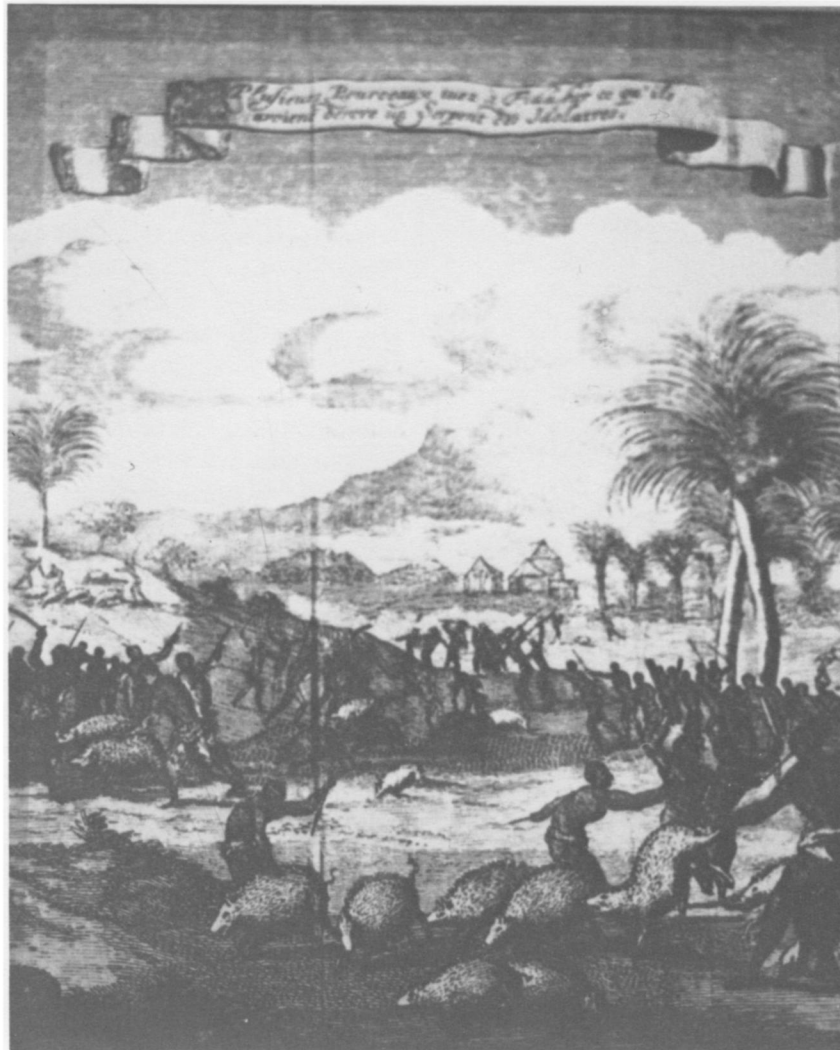
Figure 1. "Many Pigs Killed at Fida on account of having Devoured a Serpent of the idolators," from the 1705 French translation of W. Bosman's A New and Accurate Description of the Coast of Guinea .

explanatory concepts in the discourse about fetishes were displaced from their original historically specific, mercantile context to the abstract ground of psychological and aesthetic theory.