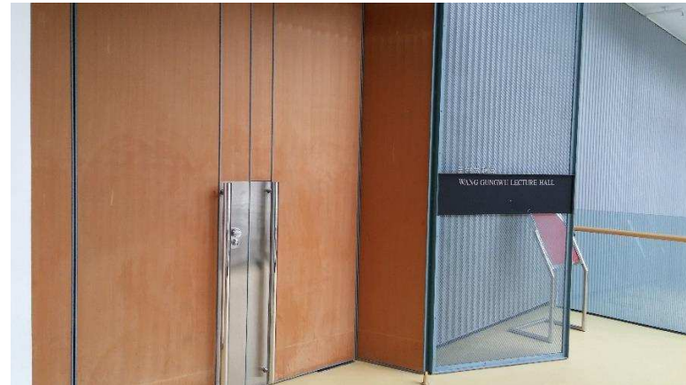
f. Walk up the stairs on your left to reach WGW entrance.

2. If you are taking bus/ minibus (routes as follows), get off at the bus stop at the West Gate in front of Haking Wong Building on Pokfulam Road . Walk towards HKU MTR Station and proceed to Exit A2. Follow the same walking route of (1) to reach WGW Theatre.