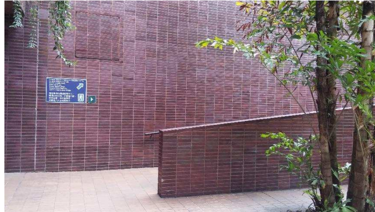
c. Walk along the path up the slope