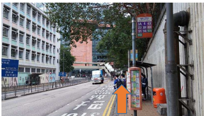
Bus /Minibus stop near to Haking Wong Building