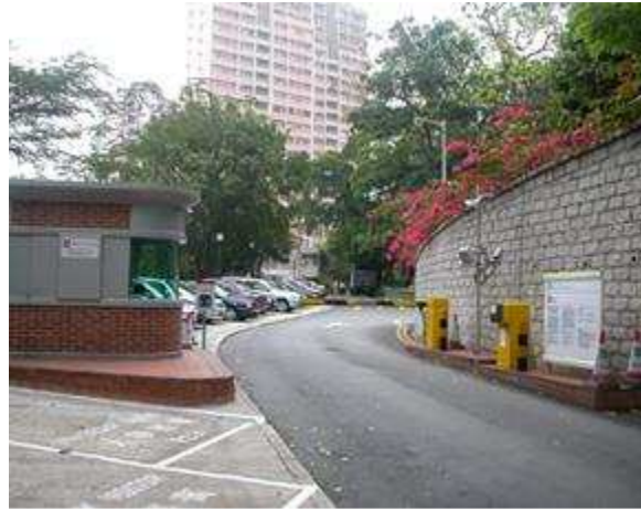
West Gate shroff

It is not easy to find a car parking space on the HKU campus, so it is advisable to take public transport.