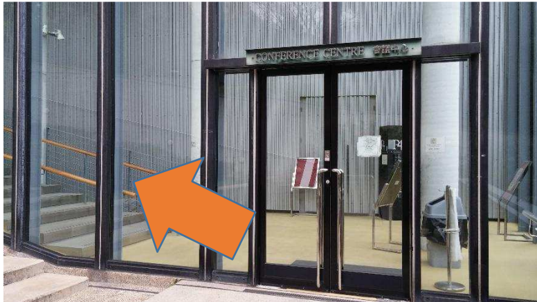
e. Enter the Graduate House from the glass door entrance