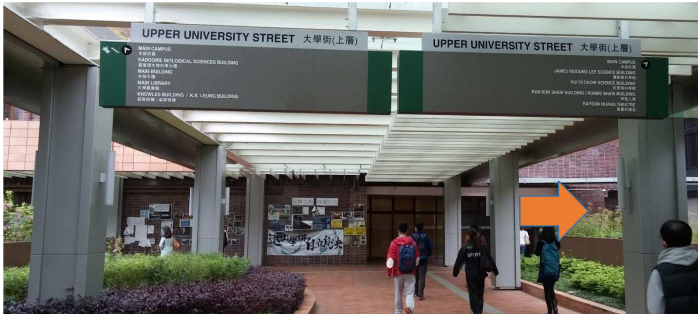
b. Turn right