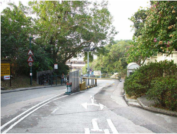
Kotewall Road shroff office