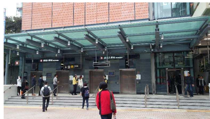
HKU MTR Station lift area (take lift to Exit A2, then follow Route [1])